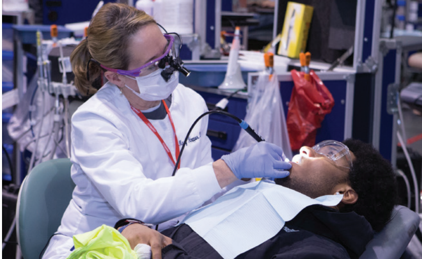
Team Smile Children's Oral Health Event – Boston