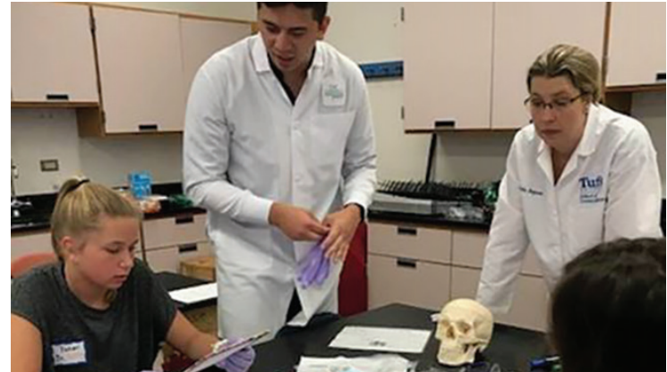
Mini Medical & Dental School for Middle Schoolers – Nantucket