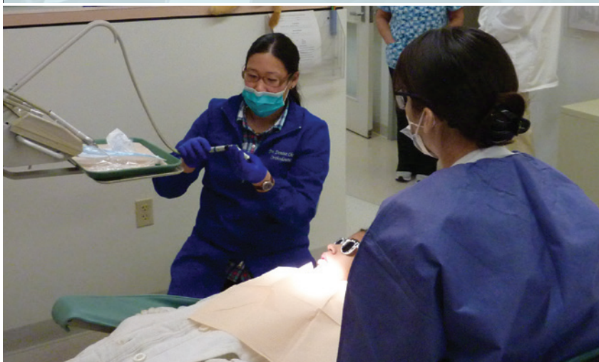
Give Kids A Smile Children's Oral Health Event – Lawrence