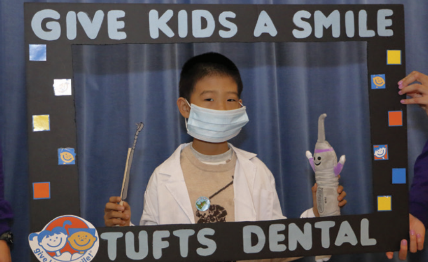
Give Kids a Smile Children's Oral Health Event – Boston