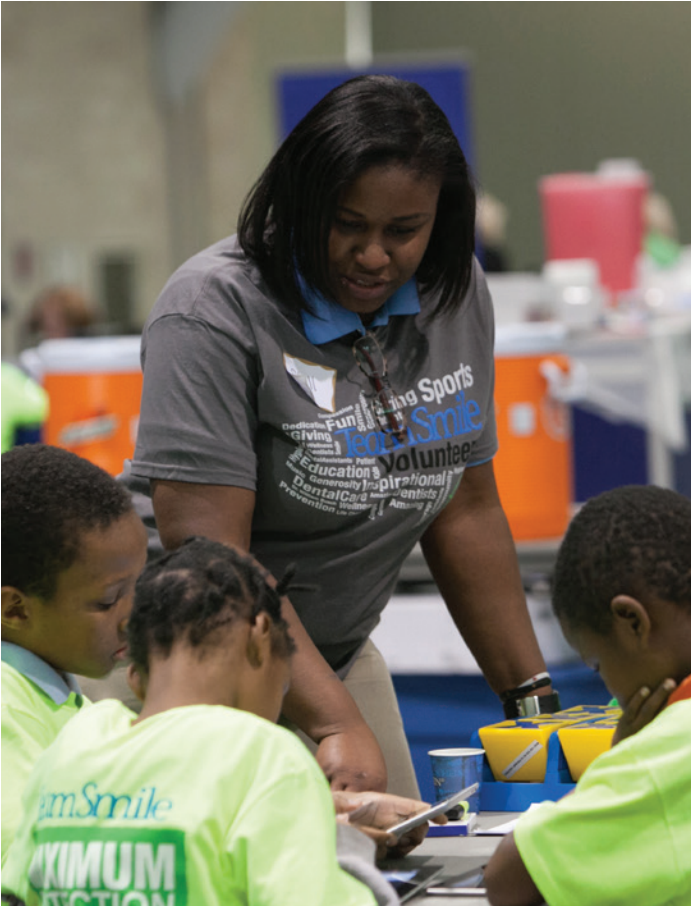
TeamSmile Children's Oral Health Event – Boston