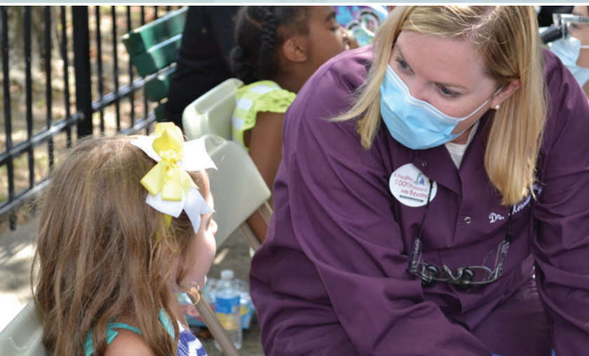
Children's Oral Health Screening – Boston