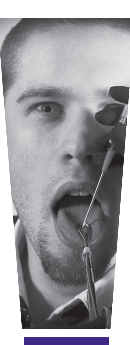
Did You Know? Oral piercings are usually administered without anesthesia.

Other side effects have been reported , including scar-tissue formation and speech impediments due to an increase in saliva flow and/or from having a foreign object in the mouth. The National Institutes of Health has even linked hepatitis to oral piercing.